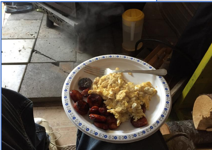
Breakfast is served!