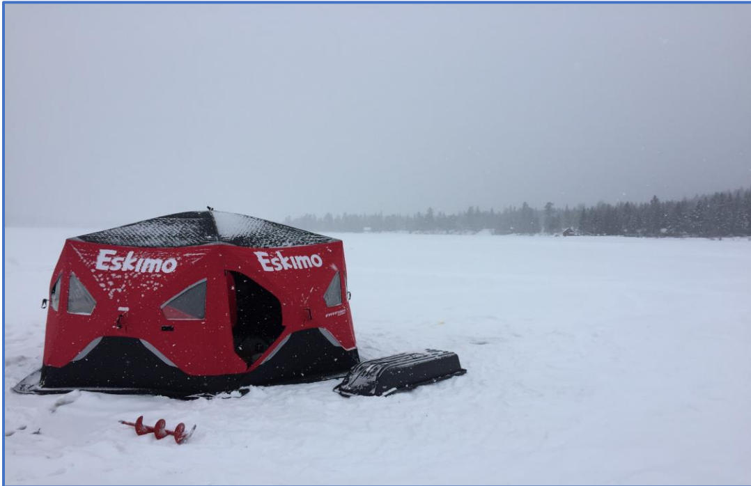
Some of the Kokanee caught that day

Lunch was had at a restaurant in the area and then we set out for Kokanee fishing afternoon #2. This day proved more productive with 6 being caught. Photos of our shelter set up on Little Dekka Lake.