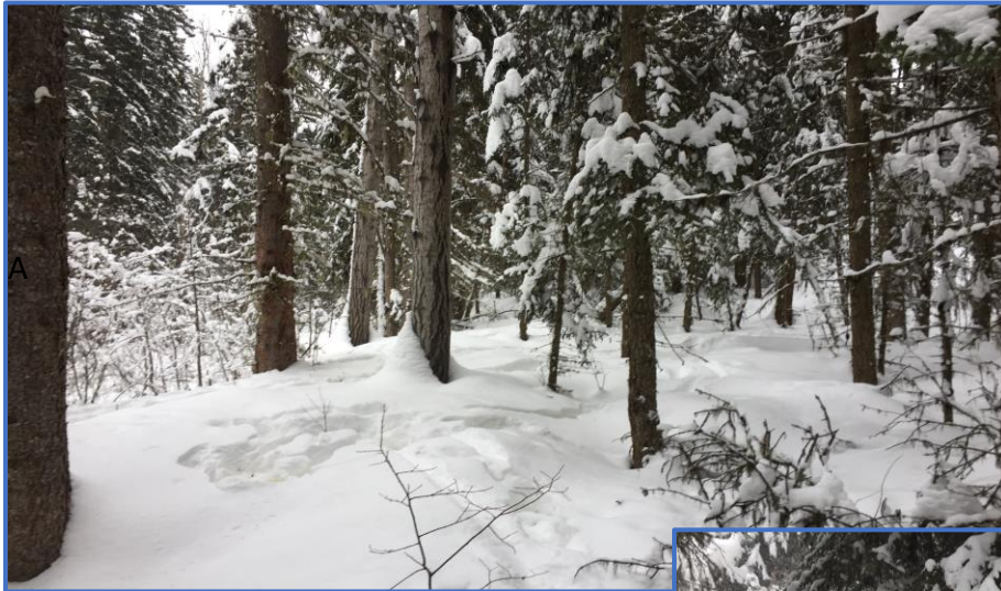
Moose tracks behind Adrian's cabin

An area where the Moose had bedded down. Difficult to see on this photo.