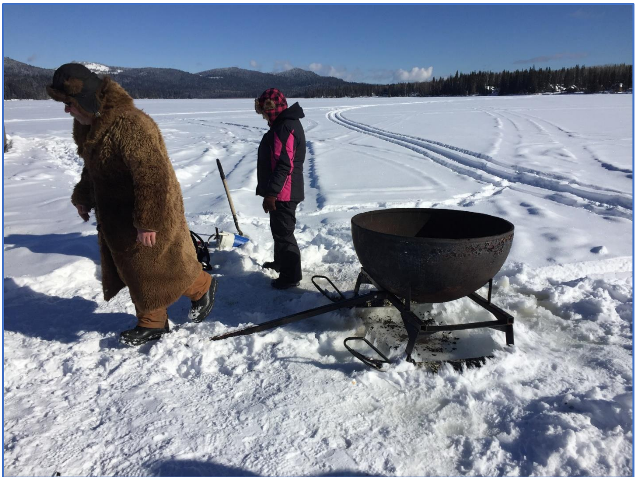
One of the people in a full Buffalo coat with his pull-behind firepit.

After a trail in was shoveled out, gear was unloaded, and a fire was lit to start heating up the interior, we decided to head out Kokanee fishing. After driving along the north side of Little Deka, we spotted a group out on the ice Kokanee fishing. When targeting Kokanee, it is important to have a fish finder to determine what depth they are feeding at. Kokanee often school together so finding where they are is crucial. Books and web sites will tell you they are often between 10-40 feet down. Being the first time targeting Kokanee at this lake, neither of us were sure where to start. Seeing a group already set up gave us a starting point and we walked out and introduced ourselves. As it was, these people were in the process of leaving so we were not only shown a good spot for Kokanee, we were also offered two freshly drilled holes! One of the people leaving had a 100+ year old full Buffalo coat purchased at a thrift store and pulled a firepit on skis behind his snowmobile. The locals know how to do it! We found out that this particular location was approximately 70 feet deep and near a drop off → a perfect Kokanee area. One of the people mentioned that they had caught one and had some bites at 15 feet in that location.