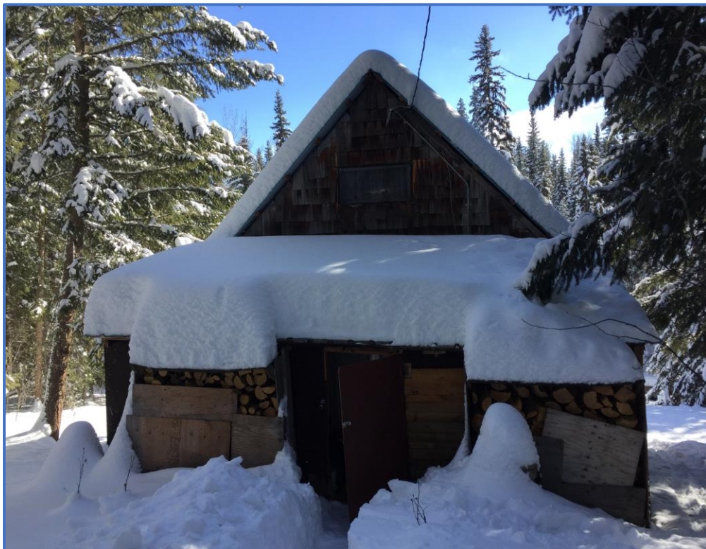
front of the cabin