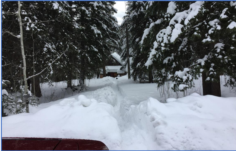
path cut in from the road

The first order of business upon arrival was to dig out the cabin. The area had a considerable amount of snow and a path had to be shoveled out to unload our gear and provide access.