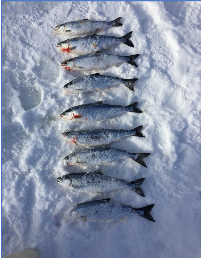
Our total catch

A mini-van on Adrian's property show the snow level in the area. Snowshoes were an absolute necessity, especially walking out on the lake to the fishing area.