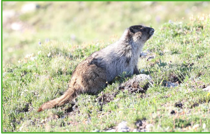
23. Columbian Ground Squirrel – 2