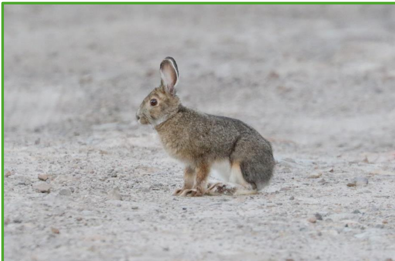
26. Snowshoe Hare – 27