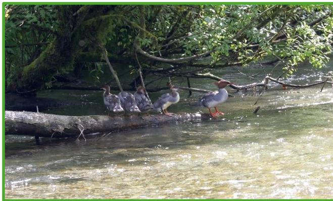
18. Red-breasted Merganser