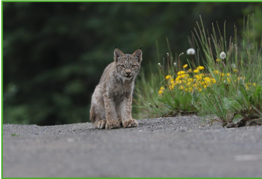
9. Canada Lynx – 1